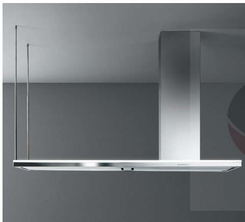
LUMEN ISOLA 175