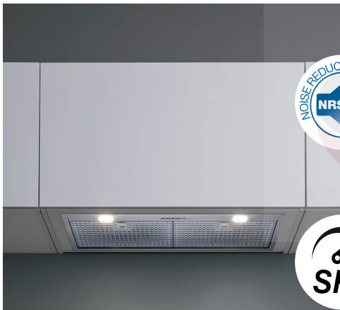
GRUPPO INCASSO NRS™