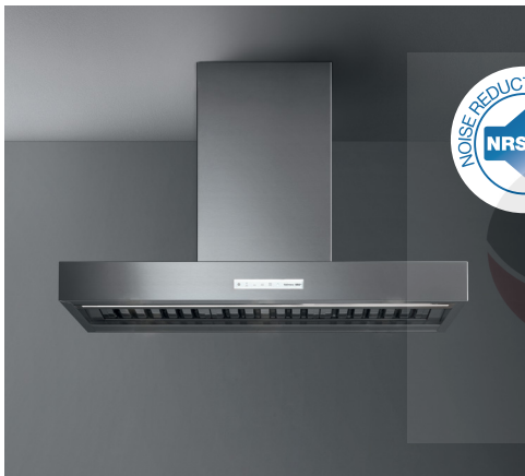
LINE PRO NRS™