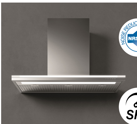
NEW! LUMEN NRS™