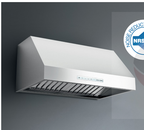
ZEUS PRO NRS™