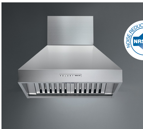
PYRAMID PRO NRS™

Transition required to go from 2x6" round duct to 1x8" round duct is included with all dual motor units.