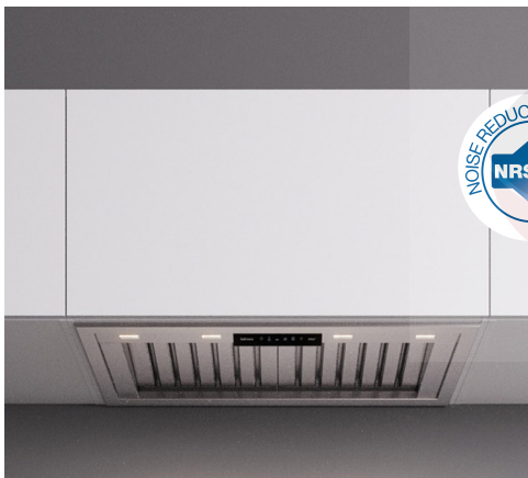
MASSIMO PRO NRS™

Transition required to go from 2x6" round duct to 1x8" round duct is included with all dual motor units.